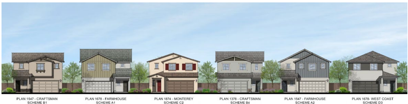
Figure 2: Typical Streetscape

Streetscape: Each plan type includes four (4) possible architectural styles, including “Farmhouse”, “Monterey”, “Craftsman”, and “West Coast” styles. Each of the architectural styles will have four (4) color schemes to provide variation for each style. Building projections and varying roof forms are used to provide visual interest in the streetscape. Consistent with the CDG, architectural treatment will be applied to all elevations of the buildings, including decorative trim, gable treatments, and application of enhanced siding. Enhanced architectural features are required for any side or rear elevation facing a public street. This will include lots with rear and side elevations facing onto Road “A”, Road “F”, and the internal roadways within the project. The architecture proposed as a part of the Oakley at Amoruso development creates a varied streetscape with visual interest, as shown in Figure 2.